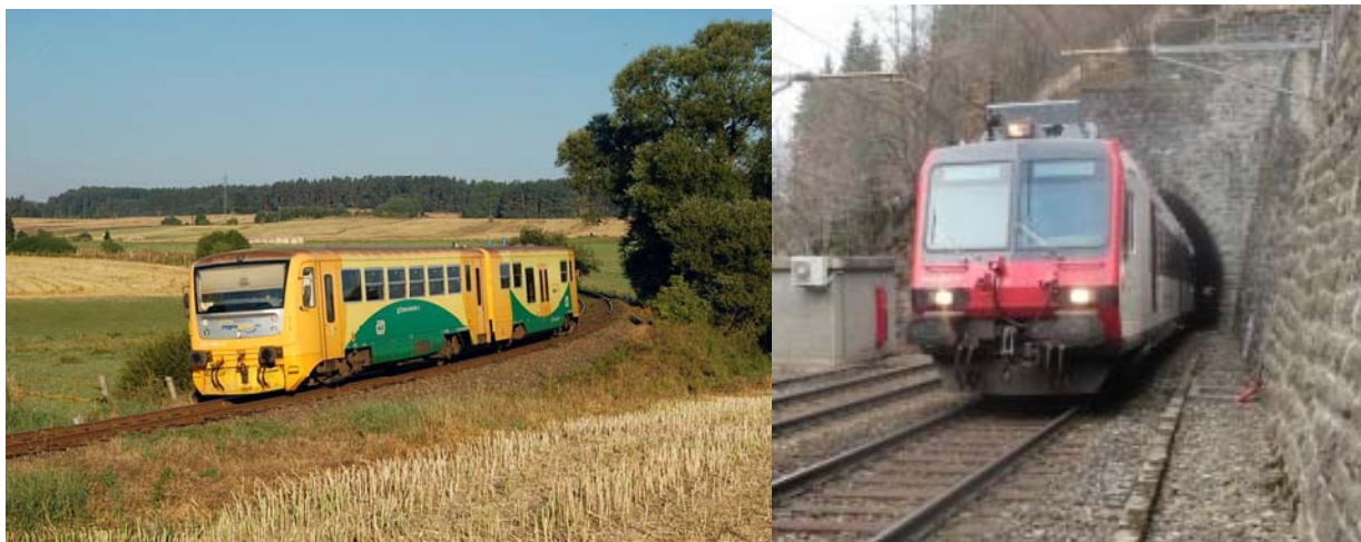
Fig. 2: STARS measurement campaign – examples of vehicles and environments

Collected data (raw GNSS signals as well as data from a number of receivers) are continuously being uploaded to a centralised, cloud-based repository, giving easy access to all project partners across Europe to perform the individual types of analysis.